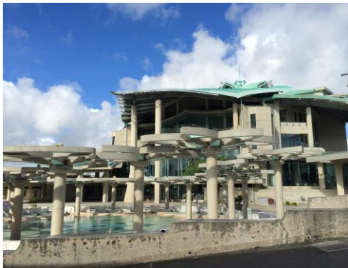
Fig.1 Okinawa convention center

The 16th International Symposium on Flow Visualization (ISFV16) was held at Okinawa convention center (Fig.1) in Ginowan-city, Okinawa, Japan from June 24 to 27, 2014. The conference was chaired by Prof. Okamoto (Tokyo Univ.) and was sponsored by the Visualization Society of Japan (VSJ),