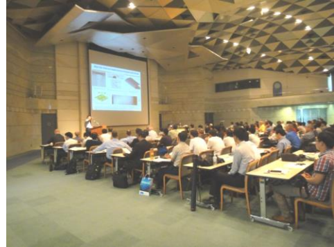
Fig. 2 A picture in the plenary lecture