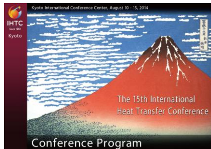
Fig. 1 Cover of program booklet.